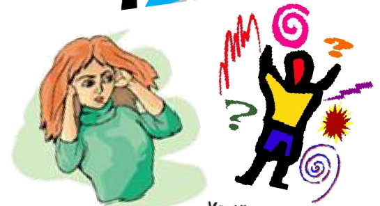
Vestibular/ Movement Activities Picture Word Cards